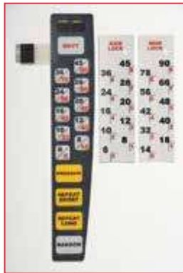
Standard and Customized Lengths Available